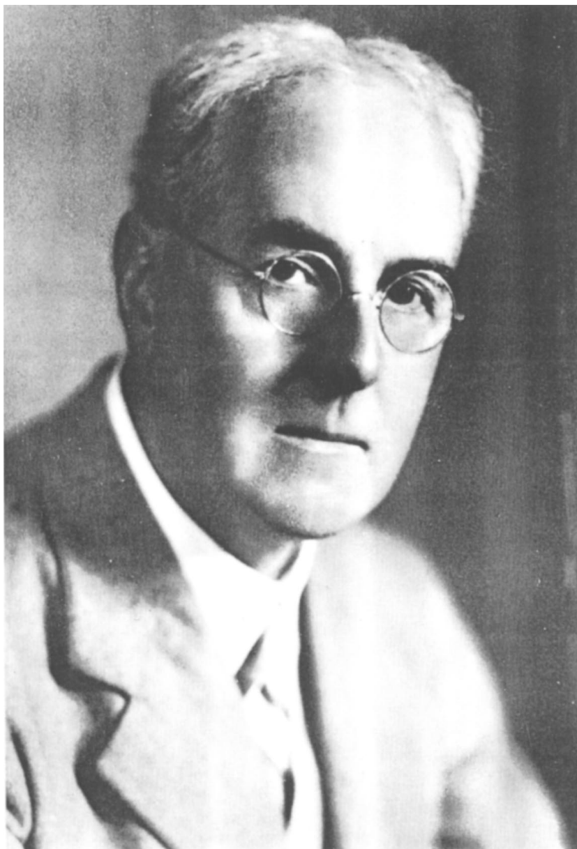
LEWIS FRY RICHARDSON. D. Sc., FRS