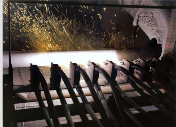
Sermatech has developed an automated process for applying the TSA Coating Protection System to piping up to 75 feet long.

Electric arc spraying feeds two electrically conducting aluminum metal wires towards each other and produces an electric arc at the point just before the two wires meet. As the arc melts the metal wires, a high pressure air line is used to spray fine droplets onto the properly cleaned and prepared steel surface. The arc spray process results in superior bonding (2000+ psi; ASTM C633) and high productivity.