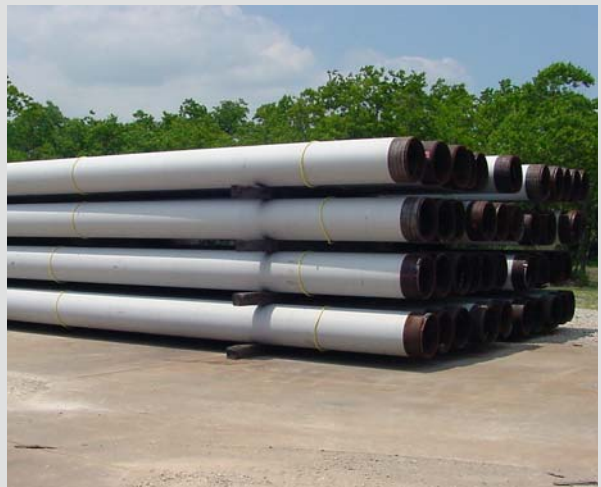
The TSA Corrosion Protection System functions as the sole source of corrosion protection for subsea piping.