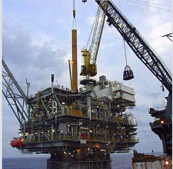
A buoyancy can (9.5' in diameter x 180' long) coated with the TSA Corrosion Protection System craned into a spar platform. The production riser and keel piping also were coated with the TSA Corrosion Protection System.