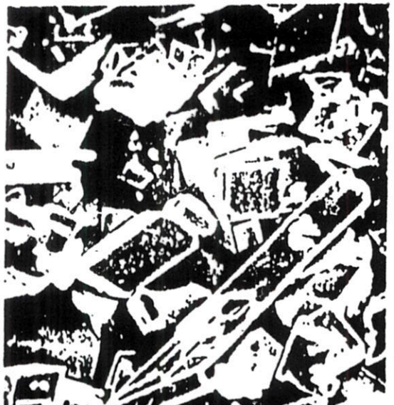
FIGURE 3-5 Angular powder particles.