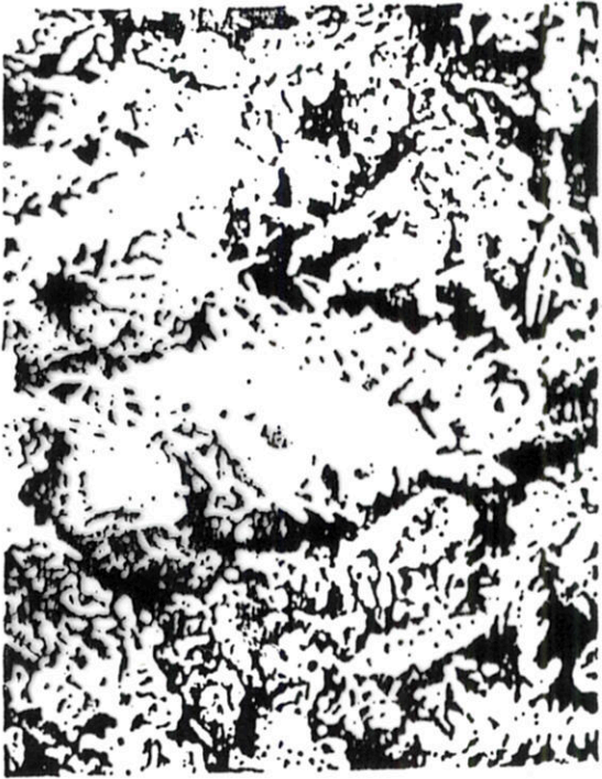
FIGURE 3-6 Dendritic powder particles.