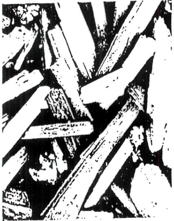
FIGURE 3-7 Fibrous powder particles.